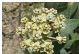
Desert Milkweed Asclepias erosa

Savannahs and prairies.