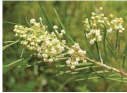
Whorled Milkweed Asclepias verticillata

Well drained soils.