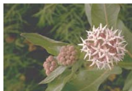
Showy Milkweed Asclepias speciosa

Dry climates and plains.