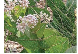
Sandhill/Pinewoods Milkweed Asclepias humistrata

Hydrated soils.