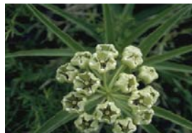
Antelopehorn Milkweed Asclepias asperula

Well drained soils.