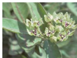
Green Antelopehorn Milkweed Asclepias viridis Dry areas and prairies.