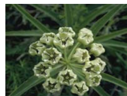
Antelopehorn Milkweed Asclepias asperula Desert and sandy areas.