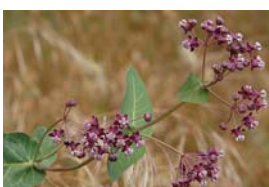
Heartleaf Milkweed Asclepias cordifolia

Grassy areas.