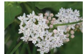
Arizona Milkweed Asclepias angustifolia

Desert areas.