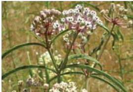
Mexican Whorled Milkweed Asclepias fascicularis

NOTE: Excludes California and Arizona; see below for those regions.