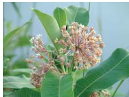
Common Milkweed Asclepias syriaca Well drained soils.