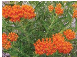
Butterfly Weed Asclepias tuberosa Well drained soils.