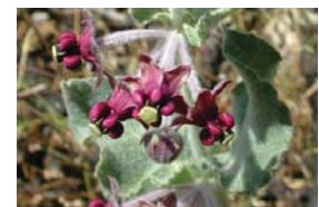
California Milkweed Asclepias californica

Desert regions.