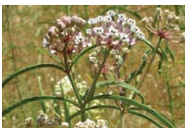
Mexican Whorled Milkweed Asclepias fascicularis

Dry climates and plains.