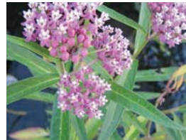
Swamp Milkweed Asclepias incarnata Damp, marshy areas.