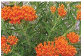
Butterfly Weed Asclepias tuberosa

Well drained soils.