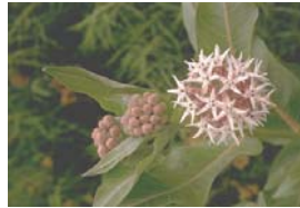
Showy Milkweed Asclepias speciosa

Dry climates and plains, except in CO, UT, NM & AZ.