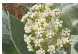
Woolly Milkweed Asclepias vestita

Dry deserts and plains.