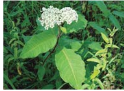
White Milkweed Asclepias variegata

Prairies and open areas.