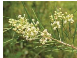
Whorled Milkweed Asclepias verticillata Prairies and open areas.