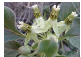
Zizotes Milkweed Asclepias oenotheroides Sandy/rocky prairies and fields.