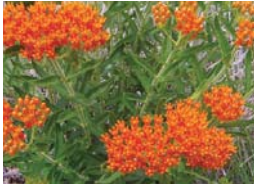
Butterfly Weed Asclepias tuberosa

Well drained soils.