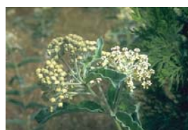
Woolly Pod Milkweed Asclepias eriocarpa

Dry deserts and plains.