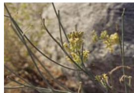
Rush Milkweed Asclepias subulata

Desert and sandy areas. Photo by Norman G. Flaigg, Lady Bird Johnson Wildflower Center