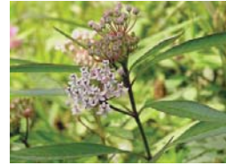
Aquatic Milkweed Asclepias perennis

Thickets and Woodlands.