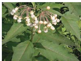
Poke Milkweed Asclepias exaltata Woodland areas (except in NE, KS, MO, ND & SD).